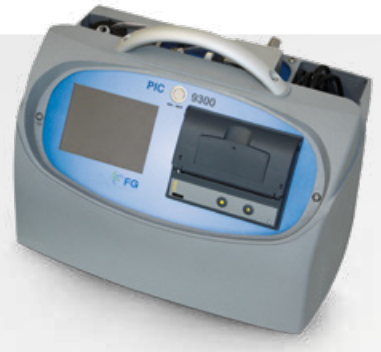
Particle counter PiC 9300

Filtration Group's handy particle counter makes it easy to measure the purity of lubricating oils and hydraulic fluids. The measurement is based on the principle of photometry, in which the concentration of certain substances is determined over the spectrum of absorbed light. The particle counter, which is equipped with a sensor and a pump volume control unit, displays the absolute particle numbers as well as the cleanliness classes in suction or pressure operation. Up to 2,600 measured values can be displayed on a touchscreen display and automatically stored according to ISO 4406, SAE AS 4059 or NAS 1638. The simultaneous management of up to 64 measurement series makes it possible to carry out successive measurements on several machines and evaluate them later. The employee can either print out the measured values via the integrated thermal printer or save them via the USB and serial interfaces.