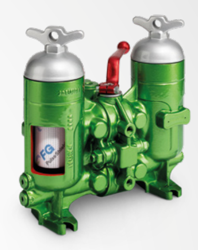
Low pressure duplex

Duplex filters from Filtration Group are particularly suitable for use in machines and motors that must operate continuously. The filter elements can easily be changed during operation with a simple turn of our ergonomically designed handle. A special lever in the handle allows switching and pressure compensation with one hand. Thanks to this patented one-hand switch, the system can continue to run without interruption. When filter elements need to be replaced, a standard maintenance indicator signals the production floor. In continuous running filter systems, the elements can be removed and replaced in one filter housing while the other filter housing takes over. In larger filter systems, the elements can be removed from the top. The systems meet the highest demands in terms of ergonomics and economy.