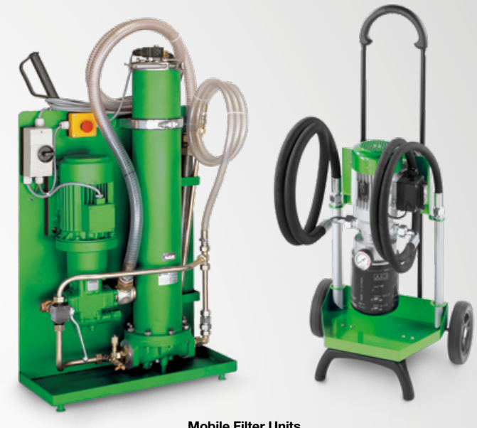
Mobile Filter Units

Filtration Group offers complete portable filter systems with connected pumps. The Filtration Group portable filter units are ideal for off-line filtration, flushing, or fluid transfer. Our carts are also used to clean oils and lubricants in existing in-line hydraulic and lubrication systems. Equipped with appropriate filter elements, these systems also filter highly viscous media efficiently and reliably according to proper ISO cleanliness classes. Thanks to their engineered design, Filtration Group equipment achieves top results in terms of dirt holding capacity and longevity.