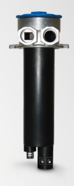
Suction return line filter Pi 550

Suction return line filters combine the features of suction and return filters in one system. Their compact design is ideal for use in mobile hydraulic systems such as agricultural and construction machinery. The return flow is directed through the filter element and immediately drawn back in again by the pump. An integrated valve prevents pressure loss, so less energy is required than with two separate systems. The excess oil flows back into the tank. If too little oil is available in the return flow, a valve draws additional hydraulic oil out of the tank. A suction filter stage is integrated in the filter element to prevent dirt in the tank from reaching the downstream system. Additional protection is provided by a bypass element that drains dirty oil from the tank when the element's capacity is exhausted. With the Pi 550, Filtration Group has a suction return line filter that is perfectly adapted to the challenging conditions for mobile machines.