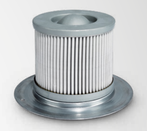
Star pleated oil separator element

Oil separators are essential for compressor manufacturers because they offer advantages such as energy efficiency, life cycle costs and environmental friendliness. End users are seeking to reduce the total cost of ownership of compressed air system. In addition, compressors are becoming ever more compact in order to take up as little space as possible. Filtration Group responds to these challenges by continuously optimizing its oil mist solutions. The oil separators meet two central requirements: They separate the oil added to the air flow for lubrication, sealing and cooling to a residual oil quantity of 1 mg/m³ with relatively no impact on the resulting differential pressure compared to conventional oil separators.