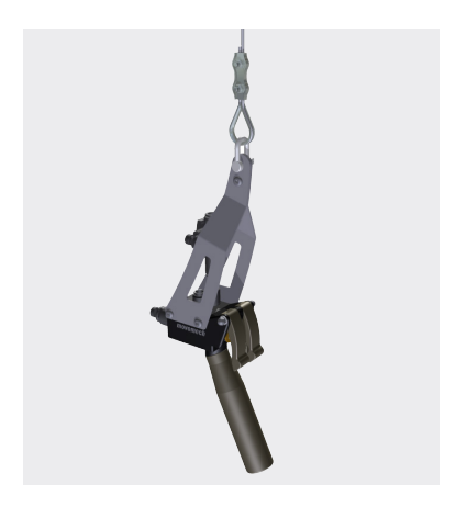
Mechline Pro speed handle