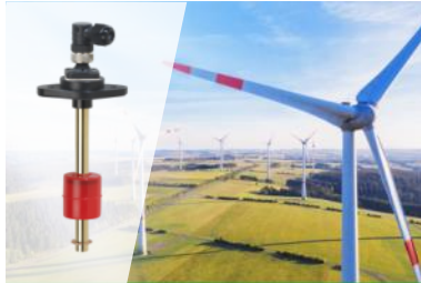
Wind power plant