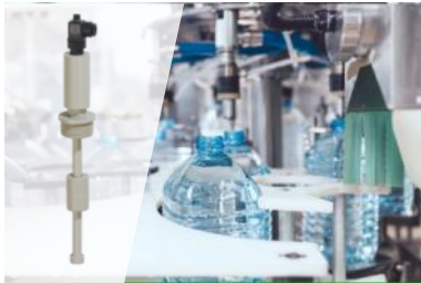
Dosing & Filling Technology