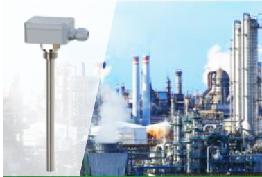
Tunnel Boring Heavy Industry