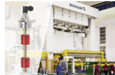
Machinery & Plant Engineering