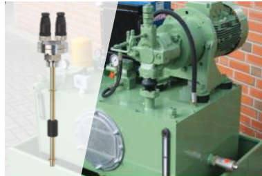
Hydraulic Power Units