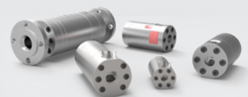
KEM Helical Flow Meters (SRZ Series)